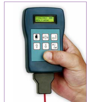
Plug-in type sensor allows one-handed operation

The BTM-400PLUS's LED-optical sensor is unaffected by ambient noise, offering