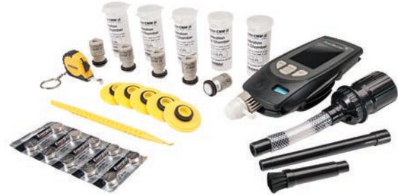
PosiTector CMM IS Pro Kit includes the PosiTector DPM Advanced

Replacement chambers, salt solutions, tools, caps, stackable probe extensions, and fins are available upon request