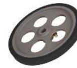
12" Measuring Wheel Item # DT12