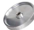
12" Measuring Wheel Item # LMA-3