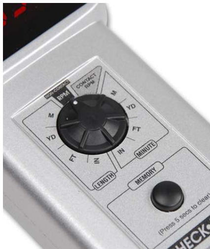
DT-200LR Series gauges are supplied as a complete kit, details on side 2.