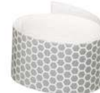
Reflective Tape Item # 205T