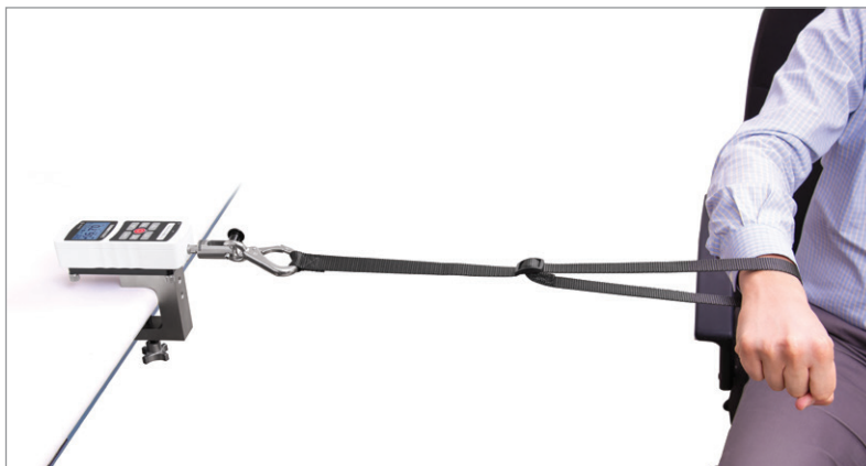
Force gauge shown in a horizontal orientation