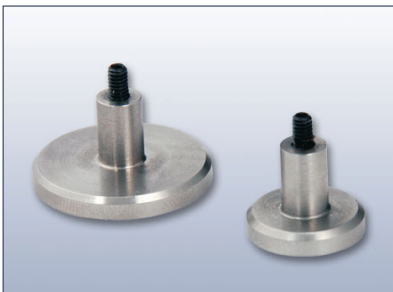
Presser feet in different diameters suit a wide range of testing requirements.

MTG Benchtop Contact Thickness Gauge provides accurate dimensional (thickness) testing of rubber, fabrics, foams, tapes, films and a wide variety of other materials.