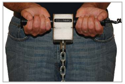
^ A Series R05 sensor is shown in a typical pull testing application. Chain is not included.