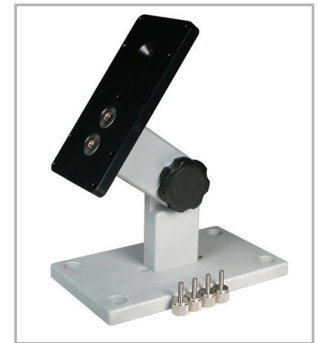
^ Optional AC1008 tabletop mounting stand