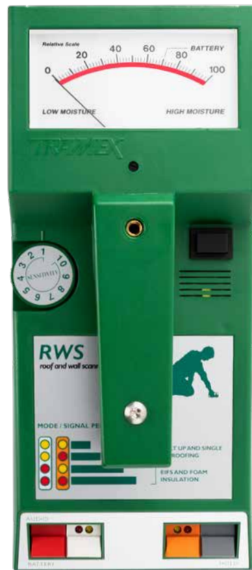
Product order code: RWS

The RWS incorporates two of the best known Tramex moisture scanners, the Leak Seeker for Roofing and the Wet Wall Detector for EIFS to give all the benefits and features of both of these time proven instruments.