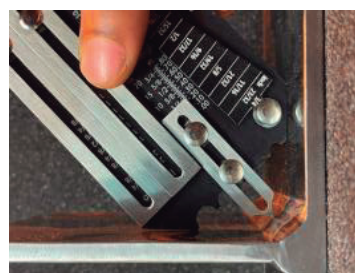
Filet Weld Throat