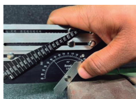
Angle of Preparation