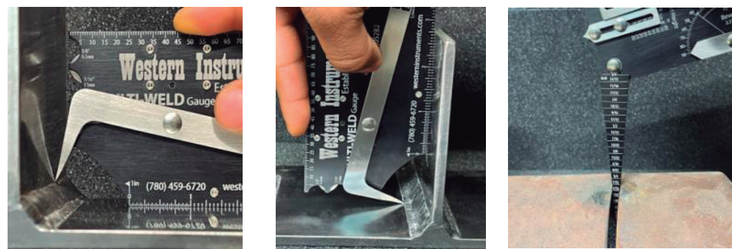
Filet Weld Height

Angle of Preparation is measured using the protractor pointer, & can be used on either side of the Pointers Pivot. The Protractor is divided into 2.5° increments, with a common compound angle of 75° (37.5° x 2) indicated.