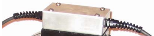
WA-Series Control Housing, with Foot Switch (not Shown)